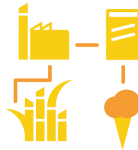
Assured Supply Chains